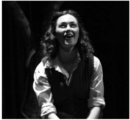
Passion Play, 2014

As we approach nearly a half-century of producing theatre, we're fully aware and so grateful that so many of you have grown to regard the Odyssey as a family, YOUR theatre. So many of you subscribe and contribute to us, not for just the obvious "hits," but for our overall body of work, for the Odyssey as an "idea"... for the Odyssey as a regular experience... a continuous part of your life. A very big "thank you" to those of you who have grown older with us through the years, as well as those younger folk who have just come on board to join the adventure. Here we are at the beginning of another fascinating year, asking for your generous help to bring you 2017's daring mix of plays, music and dance from around the world...some provocative thoughts, some deep emotions, some reflections on life, some down and out dramatic excitement... and, of course that promised bellyful of laughs.