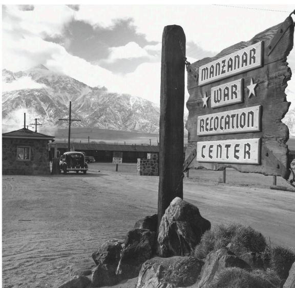
Harsh, stark, yet beautiful: Ansel Adams, ↑ Entrance to Manzanar, 1943.