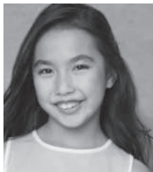
Cratchit Child / Ensemble Brooklyn Bao