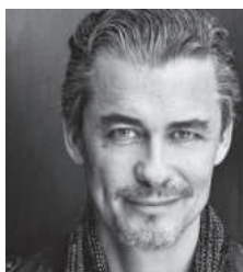
Ebenezer Scrooge Frederick Stuart*