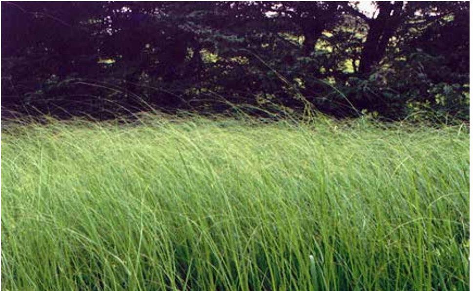
Prairie Cordgrass, Tallgrass Prairie National Preserve, Kansas