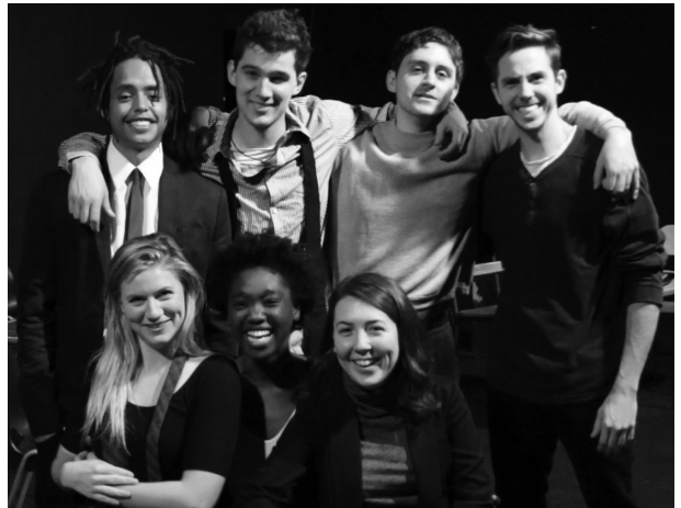
Punk Rock, 2017

As a center of the Los Angeles theater community, the Odyssey Theatre has been attracting first-class actors, directors, writers and designers to its stages for 48 years. The Odyssey continues to be a place for all people to meet up and experience the magic of live theatre! This season's upcoming productions demonstrate the Odyssey's passion for diverse, maverick work.