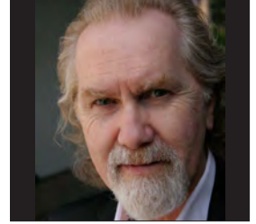
Harry Groener (SOMEBODY)