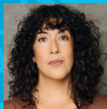
SOL MARINA CRESCO